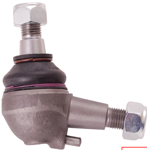
Mercedes Ball Joint