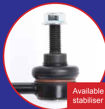
Available on stabiliser links