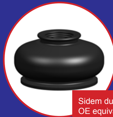
Sidem dustcover OE equivalent

The range of Sidem stabiliser links has been equipped with a new type of dustcover . This dustcover prevents that the interior part of the ball joint is polluted by dust or moist leading to corrosion and damaging of the part. The upper part of the new dustcover on stabiliser links fits perfectly into the groove of the ball joint thanks to the smart design on the level of shape and materials, making Sidem your OE equivalent .