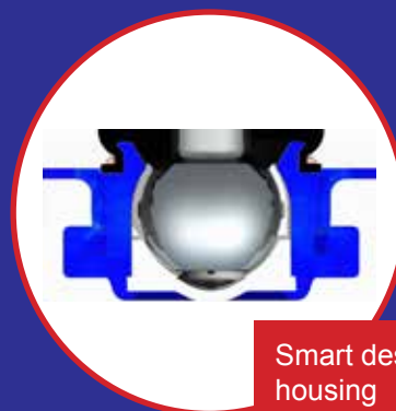
Smart design housing

Unlike most suppliers, Sidem's patented solution offers a suspension part which is reliable, straightforward and cost-effective for replacement. This reengineered part is based on a self-locking ball joint in the track control arm during installation. The ball joint's design has been upgraded with grooves making the part lock itself when pressed into the track control arm. The automatic fixation ensures easy installation with only one step. In addition, this solution guarantees maximum fixation of the part.