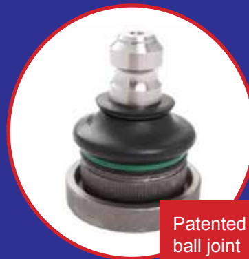
Patented solution ball joint

Sidem has developed a new patented solution for replacement of press ball joints for the Dacia, Renault and Lada range. This new solution is part of Sidem's reengineered range of steering and suspension parts and guarantees easy installation and maximum safety.