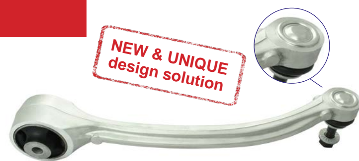
The ball joint is fully enclosed in the aluminium housing of the arm.